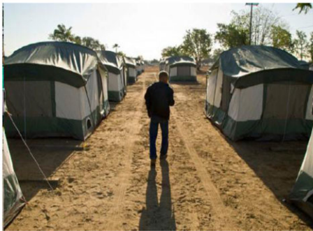
Temporary Homeless Service Area, Ontario, CA

Another instance of co-optation that emerged under different circumstances, but followed a similar process, was Ventura's River Haven Community. River Haven did not initially begin as an informal illegal encampment as Camp Hope did, but as a government-recognized encampment under democratic management of campers. However, as the camp showed no signs of moving on, city officials began questioning the goals of the partnership and decided on a plan of "improvement" that evicted all of the former residents and set up in its place a transitional housing program. Like Ontario's THSA, the camp is now managed by a city-appointed service provider and is comprised of twenty U-Domes, rented by its residents for $300–$500 a month. The encampment has set limits on lengths of stay and requires its residents to utilize a case manager. As seen in the images, both Ventura's River Haven and Ontario's THSA reflect an institutionalized order, devoid of the personal touches of Dignity's cottages, or the illegal encampment's bricolage of structures.