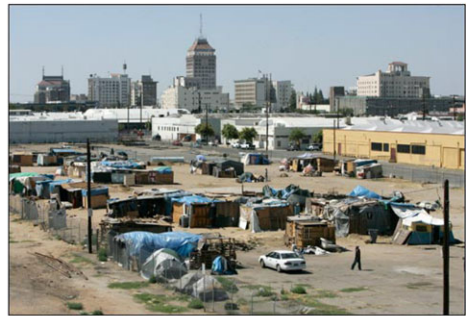
New Jack City, Fresno, CA