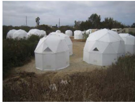
River Haven, Ventura, CA

In sum, co-opted seclusion is a double-edged sword: a strategy of repressive exclusion masked by its simultaneous productive seclusion. The strategy has proved a useful socio-spatial tool of local government in dispersing the perceived "undeserving" homeless, cleaning out environmentally degraded sites, and staging camp reforms as a progressive government action in tandem. Legitimizing its actions through aesthetic improvements and enhanced services for the lucky few allowed to remain, the local governments veiled the banishment of the vast majority of campers and hid the persistence of poverty in their jurisdictions. Therefore, co-optation, like contestation, is similarly a space of seclusion marked by intense social control that utilizes dispersion as a key spatial strategy