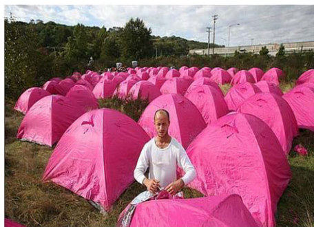
Nickelsville, Seattle, Washington