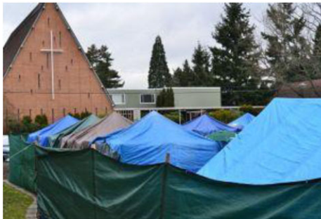
Tent City 4, Redmond, WA

The administrative strategy of legalization is accompanied by the adaptive strategy of institutionalization negotiated between the camp residents and nonprofit partners. Portland’s Dignity Village is unique in that its camp comprises its own nonprofit, whereas the other encampments under accommodative seclusion are instead adopted or managed by churches or external nonprofits. The dominant model, operating in Seattle, Kings County, and Olympia, is one in which encampments migrate to different church properties every 90 days, as seen in the image of Tent City 4. Because the primary political barrier to legalizing a permanent camp proved to be NIMBY (Not in my backyard) complaints, as it is with the siting of shelters (see Wolch and Dear 1987), the regulated rotation of encampment diffused most public opposition. The churches cover the cost of utilities and provide volunteer labor during the camps’ stay, whereas local nonprofits serve as the camps’ fiscal agents and provide food and administrative support. Campers share chores, follow mutually agreed upon standards of behavior, and meet weekly to discuss camp business and make collective decisions.