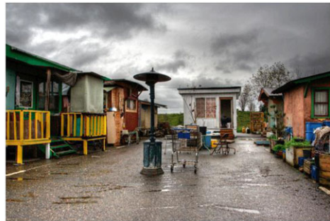
Dignity Village, Portland, OR

Besides offering greater material benefits and comforts compared to their illegal counterparts, these encampments also provide a far greater degree of security than the streets or the shelter. Each of the encampments in this category provided around the clock security administered by the residents with a consensus that violators would be expelled. During the summer I lived in the encampments of Fresno, violence was pervasive in the illegal camps, where three murders and almost daily instances of domestic abuse occurred. No one would stray far from her tent without leaving a lookout for fear of being robbed.