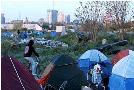
American River Encampment, Sacramento, CA

The streets and rail yards surrounding Fresno's rescue mission have long hosted a spattering of small homeless camps. It was only in 2002, however, that the camps agglomerated into semi-permanent shantytowns and tent cities comprised of dozens and eventually hundreds of campers. It was at this time that the city council passed and began enforcing new anti-homeless laws, including a sit-lie law and a no shopping cart law, in an effort to revitalize its urban core with the opening of Chukanski Park, a minor league ballpark built in the central business district. Marked by the strictly policed boundary of South Ventura Street, which divides the "tent city" and commercial district, as depicted in the photos, the city enforces a two-sided place-based policy of stark proximate segregation. In the higher rent districts of the downtown, police carry out an emboldened punitive approach, while simultaneously taking an unprecedented hands-off toleration of homeless habitation within the abandoned industrial zone. This double-edged process of exclusion and seclusion led to the initial formations of large-scale camps in Fresno, Ontario, Sacramento, and Ventura as well as the majority of reported cases not included in this west coast sample (NLCHP 2014a).